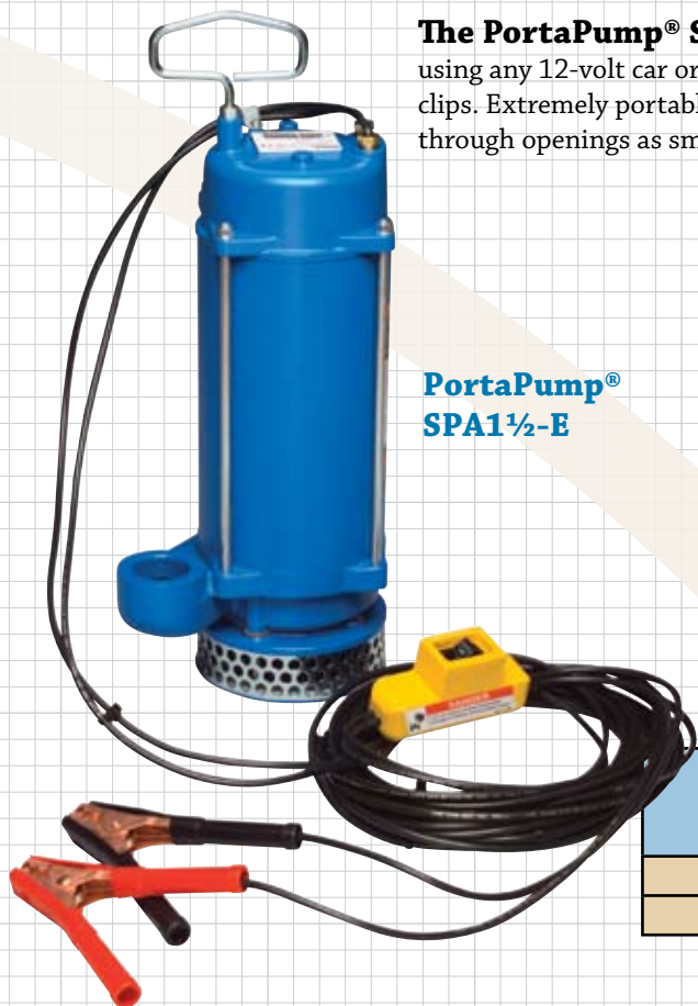
PortaPump® SPA1 1/2-E

The PortaPump® Submersible, Battery-Powered Pump operates using any 12-volt car or truck battery. It comes equipped with cables and battery clips. Extremely portable, the pump weighs only 33 pounds (15kg) and can fit through openings as small as 10" (25cm). Electrically safe and whisper quiet.